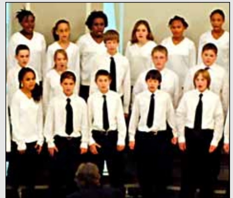
The Central Lutheran School Choir gave us high hopes for the future.