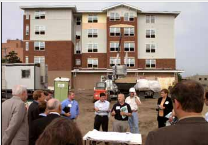
July, 2007: National, regional and local HUD officials visit the Carty Heights site to learn more about its geothermal heating and air conditioning system, which reduces energy consumption by 40-60%. Carty Heights is the nation’s first geothermally heated and cooled HUD project .

Cornelia House is a collection of 47 one and two-bedroom apartments for independent adults age 62+. Ten apartments are priced to be affordable to people with limited incomes; the rest are at moderate market rates. In 2007, the resident community continued to flourish. The Cornelia House Resident Council has