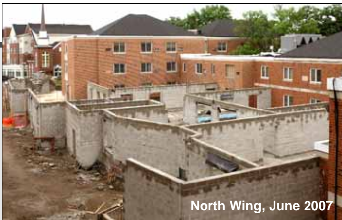
North Wing, June 2007

Nowhere else in our organization does our mission's call to "...support each individual's physical, social and spiritual needs" require more of our board, management, staff and volunteers. The needs of the Church Home's long-term residents and short-term rehab patients can change dramatically overnight. These changes make us ask ourselves, "Are there better ways to support each individual's needs?" The answer has often been yes, but for many years our responses have been limited by the model of care for which the building was designed.