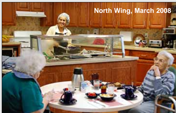
North Wing, March 2008

Another beneficiary of the Church Home's renewal project is its third-floor Transitional Care Center . The plans, finalized in 2007, called for increased capacity. 21 private rooms with private baths vs. the original 10 private and three semi-private rooms. A new rehab gym three times larger than the old one was to be added, along with a new lounge and dining area. Work was completed in mid-April 2008. Rehab patients enjoy catered meals, cable TV, their own phone and Wi-Fi for wireless Internet access from their laptop computers. "We're making it as hotel-like as we can," says Mike Karel.